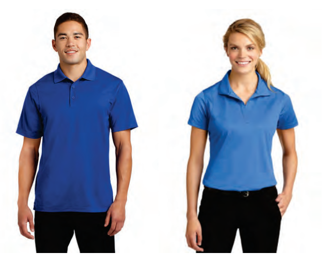
Examples of Polo Shirts without MOAA Logo

Contact Dan Brown <a href="mailto:brownaandd@hotmail.com">brownaandd@hotmail.com</a> or 651-0005 to order. Send check $34 for each shirt to Dan Brown, 60 Lake Lorraine Cir, Shalimar, FL 32579. Shirt will not be ordered until check is received.