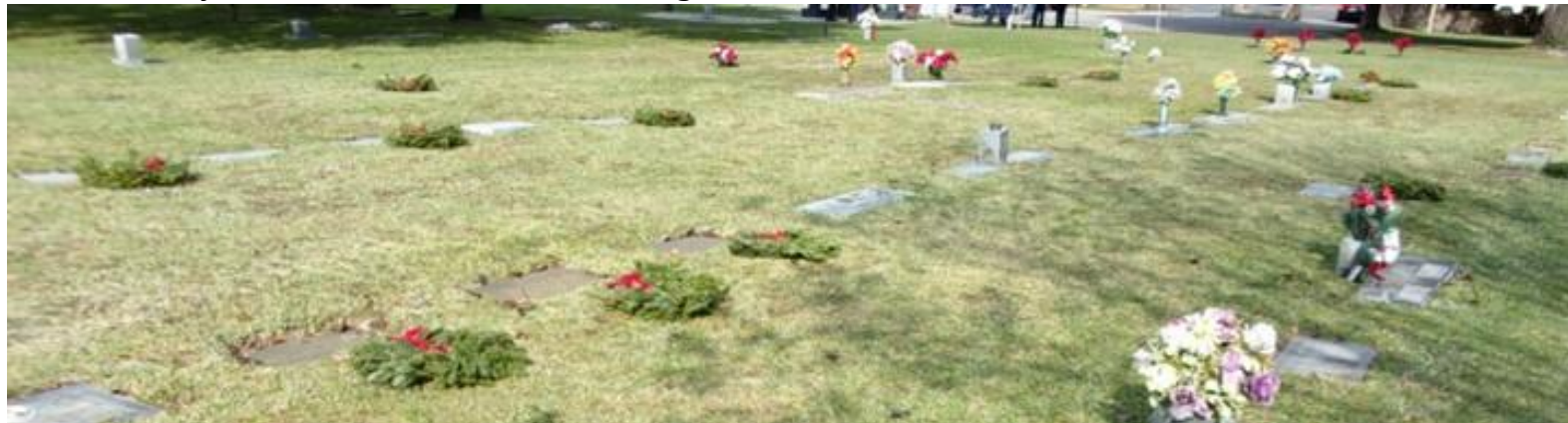
Photo of "Wreaths Across America" at the Beal Cemetery in December 2022.

This year's Wreaths Across America will be held on Saturday, December 16 th , at the Beal Cemetery in fort Walton Beach. This is the second consecutive year that NWFMOA has participated in this program to place holiday wreaths on the graves of Veterans to recognize their service to our country. At the Beal Cemetery alone there are over 1,800 Veterans interred, but in 2022 only about 1,200 received a wreath. Last year we funded 20 wreaths; this year our Chapter increased our purchase to 66 holiday wreaths in partnership with the Choctawhatchee Chapter of the Daughters of the American Revolution. If you are available on the morning of Saturday, December 16 th , please join us at the Beal Cemetery in Fort Walton Beach to help lay these holiday wreaths on our Veterans' graves. Check local media for the time of the event.