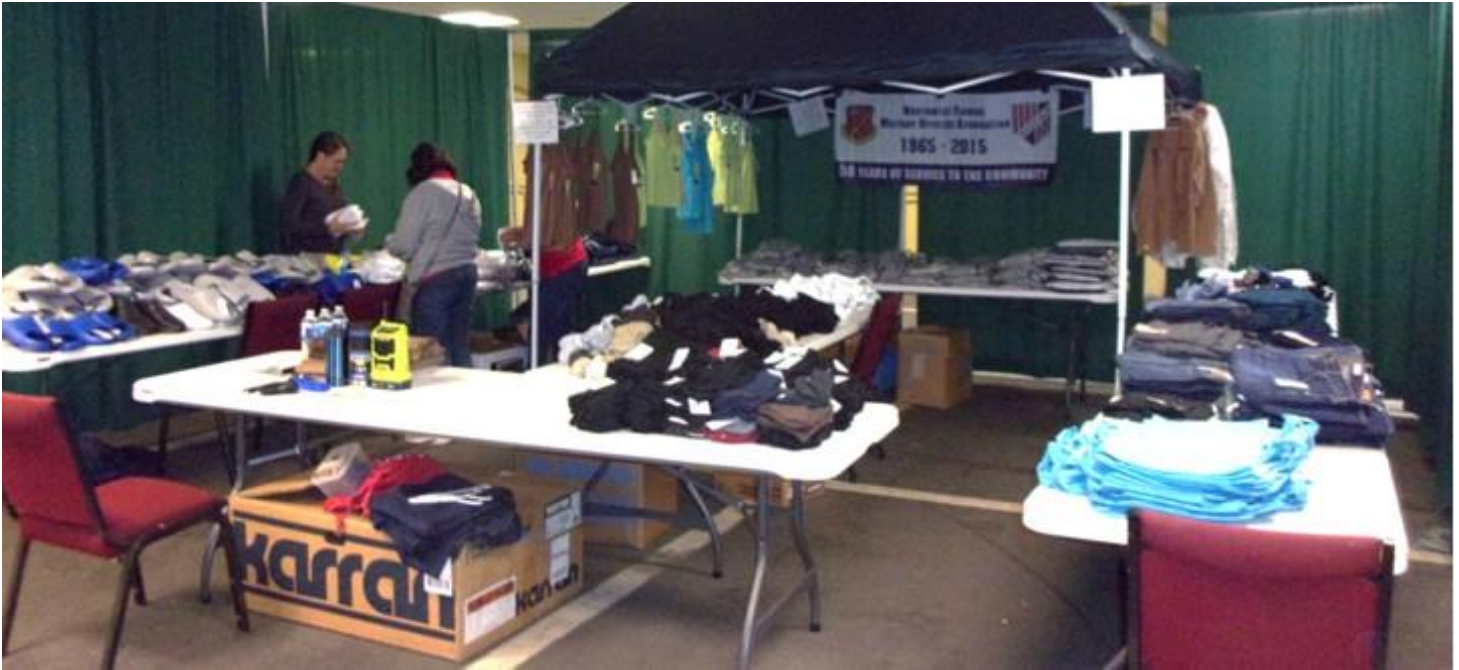
The NWFMOA booth at the Veterans' Stand Down on Nov. 8 th at the FWB Fairgrounds distributed over 1,000 items of clothing to men and women Veterans.