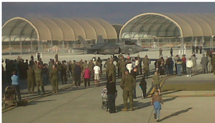
F-35Bs, the Marine Corps version with Short Takeoff/Vertical Landing capability, arrived at Eglin on January 11th.