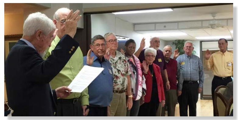
Lt Gen Manor conducts installation of 2016 officers and directors