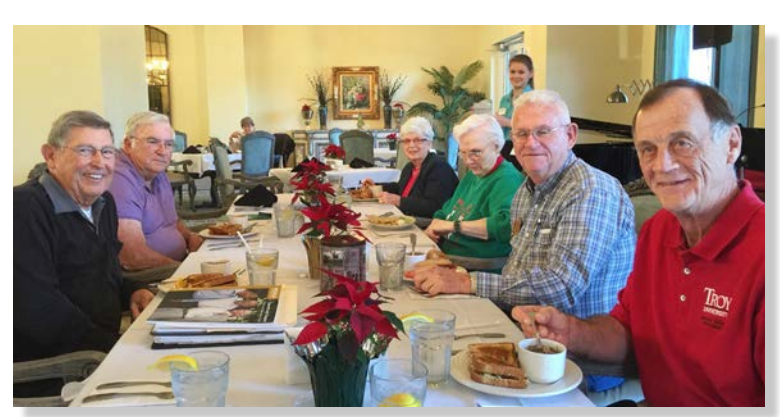
2015 Board Meets for the Last time