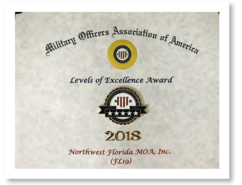
5-Star Chapter Award Certificate