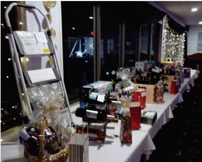
Raffle table for the Scholarship Fund at the 2021 Military Ball. All raffle prizes were donated and had a total value of over $2,000.

NWFMOA Scholarship Fund: “HELPING TO BUILD FUTURE MILITARY OFFICERS AND LEADERS.”