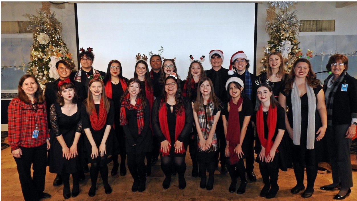
Opus One Choral Group of Niceville High School in their holiday attire at our Dec. 7 th monthly luncheon.