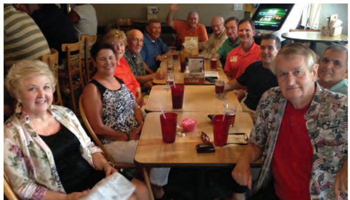
Chapter members gather for Officers Call in mid-June.