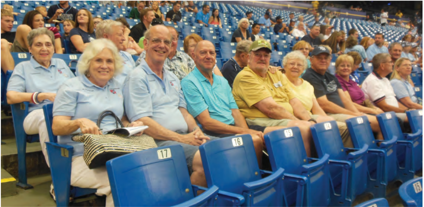
Convention attendees finish weekend with Tampa Bay Rays game.