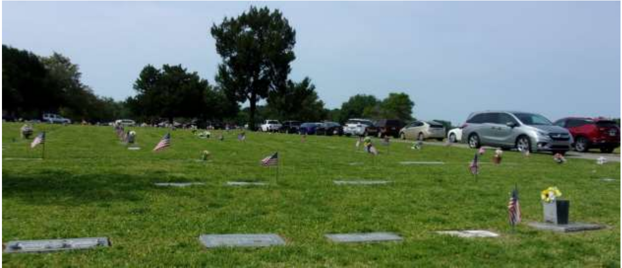
Veterans' grave sites decorated with U.S. flags by AFJROTC cadets of FWB High School