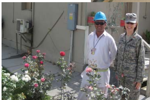
Roses in Afghanistan