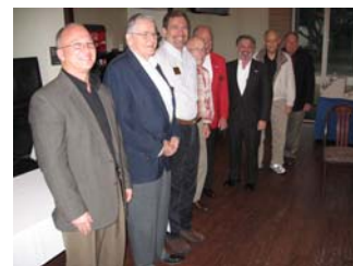
2011 NWFMOA Board Members