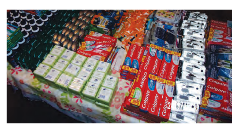
2019 Homeless Veterans Stand Down Donations

2019 Homeless Veterans Stand Down Donations : This year's Stand Down was held on October 25th. At our October luncheon, our members donated $296 in cash plus I received a check in the mail for $200 form John Feldman for a donation total of $496. This amount was matched by an anonymous donor for a total of $992 to purchase items for our homeless veterans. This resulted in assembling 101 'personal item bags' with each bag containing 2 razors, shaving cream, wash cloth, bar of soap, deodorant, toothpaste, tooth brush, manicure set, note pad, and pen (see accompanying photo). In addition, I was able to purchase